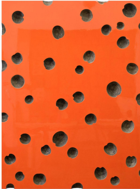
Thomas Glassford, Orange Osculum 40, 2019, Automotive lacquer on MDF, 64 1/4 x 48 x 2 in

pre-Columbian times when Indigenous civilizations cultivated and utilized them in ritual, medicine, and art, and still holds cultural significance in Mexico today. Along the center of the gallery, a seven-part stone sculpture, made from the off-cuts of stone pilings, is situated on the floor like a canal. Glassford sourced these remnants and assembled them into an aqueduct lined with gold leaf, recalling the remains of the Aztec aqueduct system that brought potable water to Tenochtitlan, now known as Mexico City.