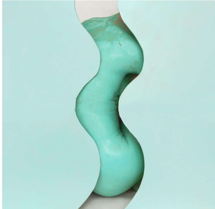
Lee Materazzi, ~~~, 2021, Archival pigment print.

Quint Gallery exhibits new works by Lee Materazzi