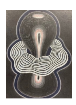
Nancy Blum Black Untitled, 2017 Colored pencil and graphite on paper (composition of 60 individual drawings) 12 x 9 in