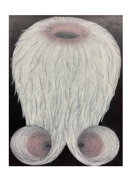
Nancy Blum Black Untitled, 2017 Colored pencil and graphite on paper (composition of 60 individual drawings) 12 x 9 in 30.5 x 22.9 cm