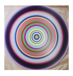
Gary Lang M Variation , 2021 Dye-bond on aluminum 36 in diameter