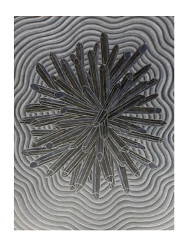
Nancy Blum Black Untitled, 2017 Colored pencil and graphite on paper (composition of 60 individual drawings) 12 x 9 in