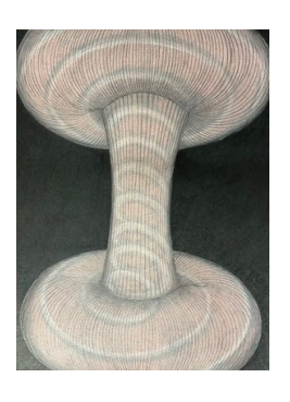
Nancy Blum Black Untitled, 2017 Colored pencil and graphite on paper (composition of 60 individual drawings) 12 x 9 in