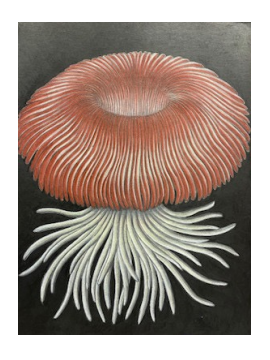
Nancy Blum Black Untitled, 2017 Colored pencil and graphite on paper (composition of 60 individual drawings) 12 x 9 in