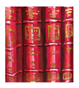
Jean Lowe Red Filler Books, 2020 Casein on papier mâché 10 x 12 x 8 in