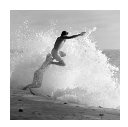
Roy Porello Shore Break Jump, Windansea, 1962 digital print 40 x 40 in Edition of 15 plus 2 artist's proofs (#4/15)