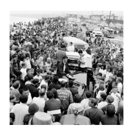
Roy Porello Concert, Pacific Beach, 1965 digital print 40 x 40 in Edition of 20 (#3/20)