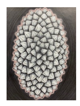
Nancy Blum Black Untitled, 2017 Colored pencil and graphite on paper (composition of 60 individual drawings) 12 x 9 in