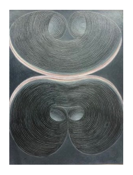
Nancy Blum Black Untitled, 2017 Colored pencil and graphite on paper (composition of 60 individual drawings) 12 x 9 in