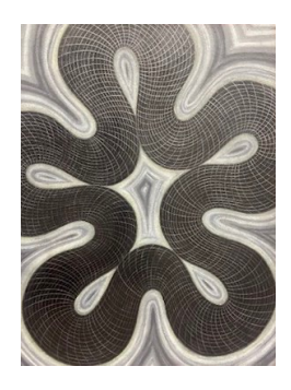
Nancy Blum Black Untitled, 2017 Colored pencil and graphite on paper (composition of 60 individual drawings) 12 x 9 in