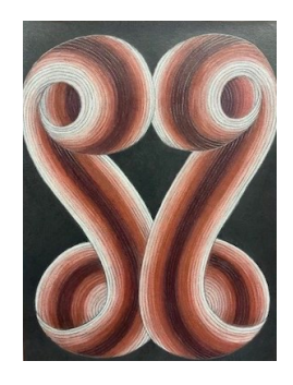
Nancy Blum Black Untitled, 2017 Colored pencil and graphite on paper (composition of 60 individual drawings) 12 x 9 in